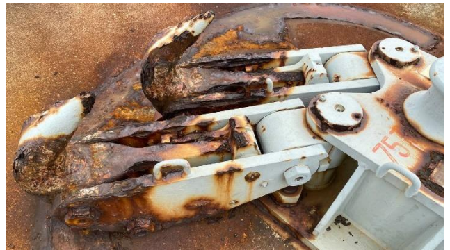
Photos taken before ZINGA repairs